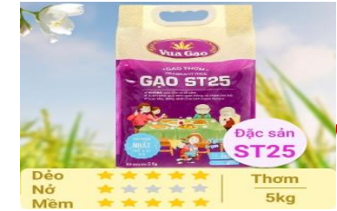
Rice grain (65%)