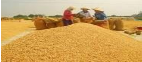
Rice seed (50%)